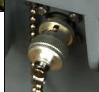
Weather-proof BNC antenna socket